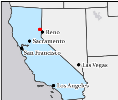
FIGURE 2 TITLE: SITE MAP -SHOWING- SPRINGS AND STREAMS VINTON, CA JOB NO.: SVLWA002 DATE: 1/20/2025